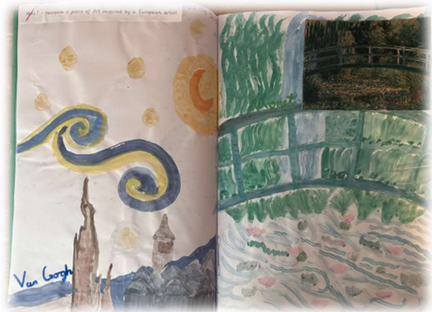
Creating artwork inspired by European artists.